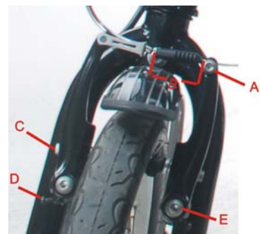
A-Cable clamp bolt B-No contact C-pad fixing bolt D-Centering screw E-Arm fixing bolt