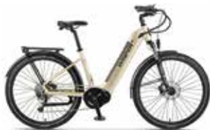
M7 STEP THROUGH MID DRIVE CITY