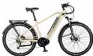
M9 CROSS BAR MID DRIVE CITY