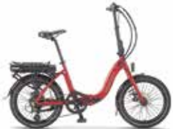
806 20" FOLDING BIKE