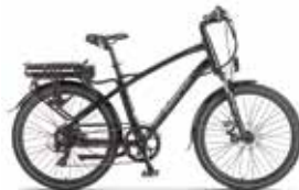
905 26" CROSSBAR BIKE

Our traditional range ebikes run on the tried and tested cadence sensor system. When the pedals are turned the power engages. We use rack batteries to power the bikes. These bikes are easy to maintain and simple to run. We have been supplying these superb value bikes into the UK now for five consecutive years during which time they have become a great favourite.