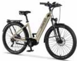
STEP THROUGH MID DRIVE WITH ADVENTURE PACK