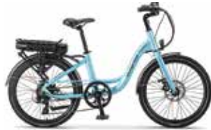
705 24" STEP THROUGH BIKE