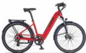
H7 STEP THROUGH HUB DRIVE CITY