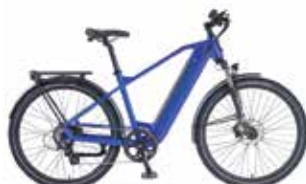
H9 CROSS BAR HUB DRIVE CITY

All specifications are correct at time of printing but are subject to change