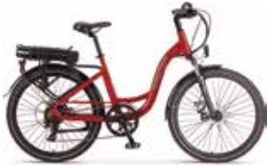
705 26" STEP THROUGH