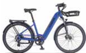
STEP THROUGH HUB DRIVE CITY WITH FRONT RACK