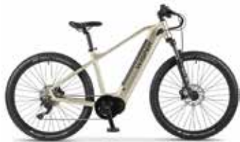
CROSSBAR MID DRIVE WITH MOUNTAIN PACK